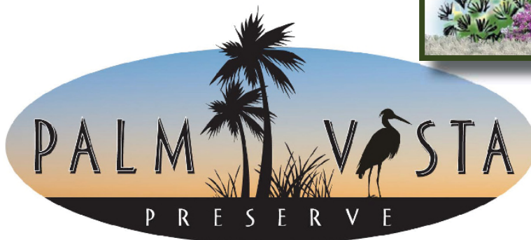
Custom Logo Design