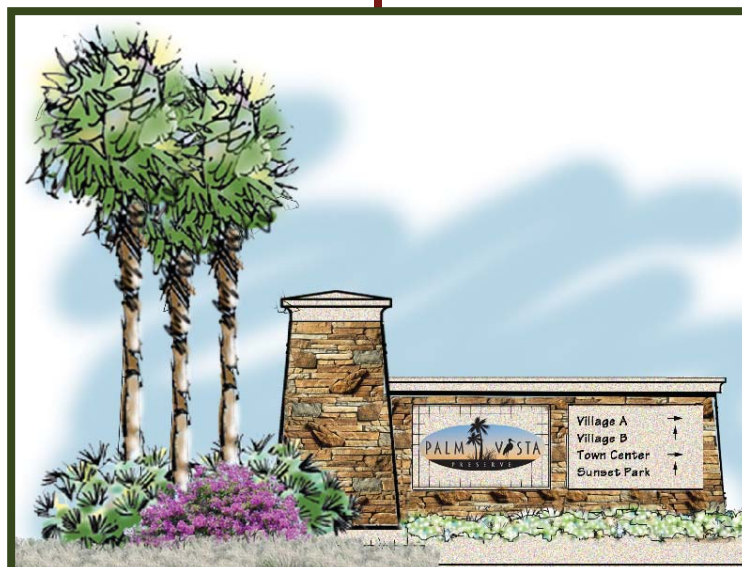
Directional Signage Concept

Use the primary intrinsic value of the site (its location adjacent to the St. Johns River Marsh) as inspiration for a sunset themed design vocabulary.