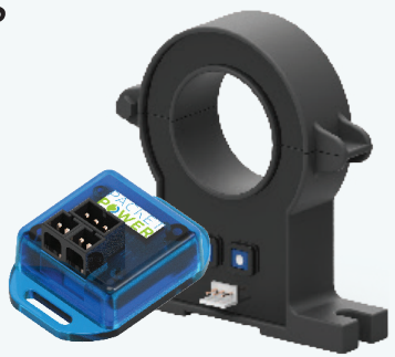
Wireless Power Monitor: External CT

35 or 65 Amp current sensors. Fits conductors up to 8mm in diameter.