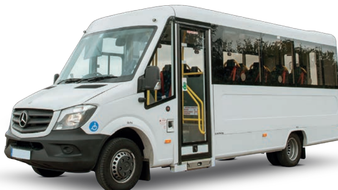
Vehicle shown is for illustration purposes

Website: flexerent.co.uk Email: info@flexerent.co.uk Phone: 01743 457685