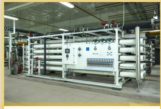
Built: 2008, Capacity: 3 MGD

Central Iowa Water Association distributes water to 18 counties in central and northeast Iowa. Currently this plant is one of the largest RO plants in Iowa and it won the AWWA 2011 National Best Tasting Water Award. After ten years of operation this system is still operating on the original membranes and has never had to clean. It is very popular for tours and educational events.