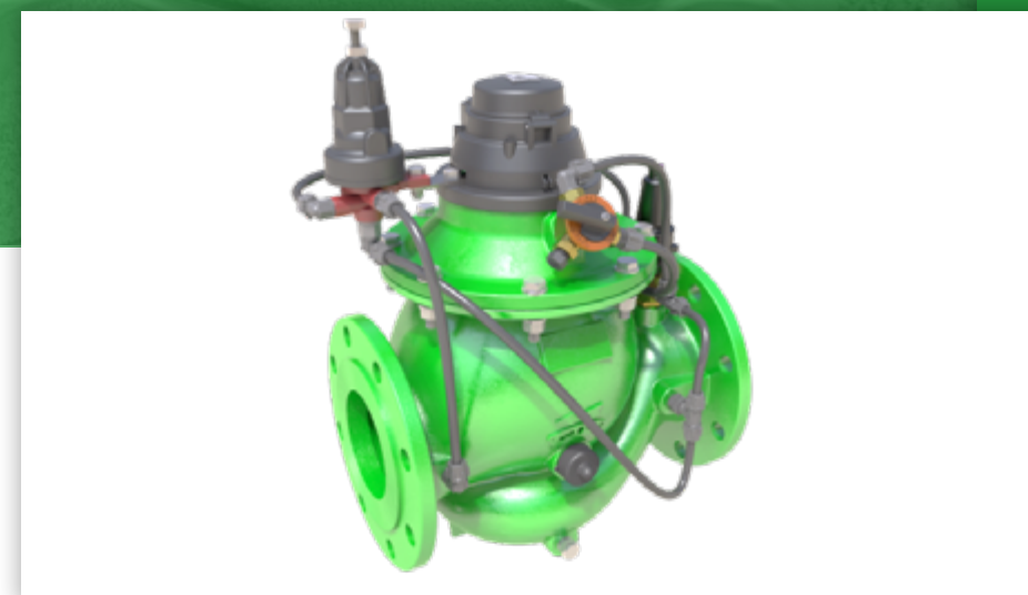
BERMAD IR-900 "Christmas Tree"

The valve components include internal upper & lower flow straighteners, so no upstream or downstream straightening distances from the water meter are required.