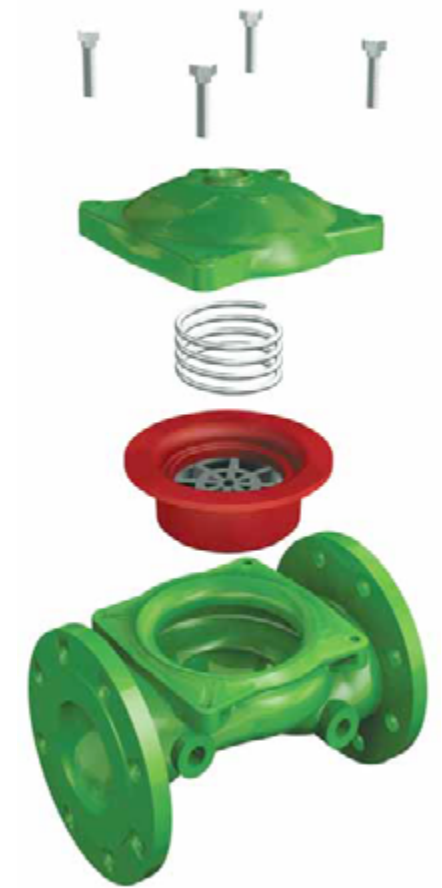
IR-400 Series explode view

the BERMAD IR-400 Series series is composed of 4 components, a cover, a spring, a diaphragm assembly and a valve body, but that is not the reason why it's called the IR-400 Series?