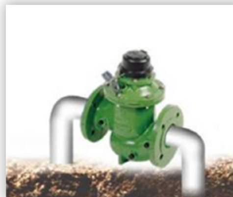
BERMAD 900 compact installation