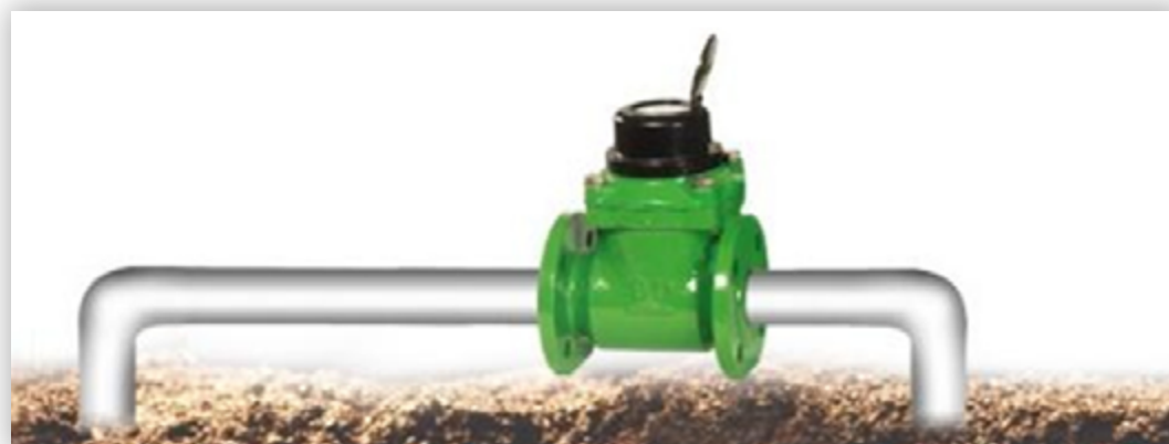
Standard water meter installation