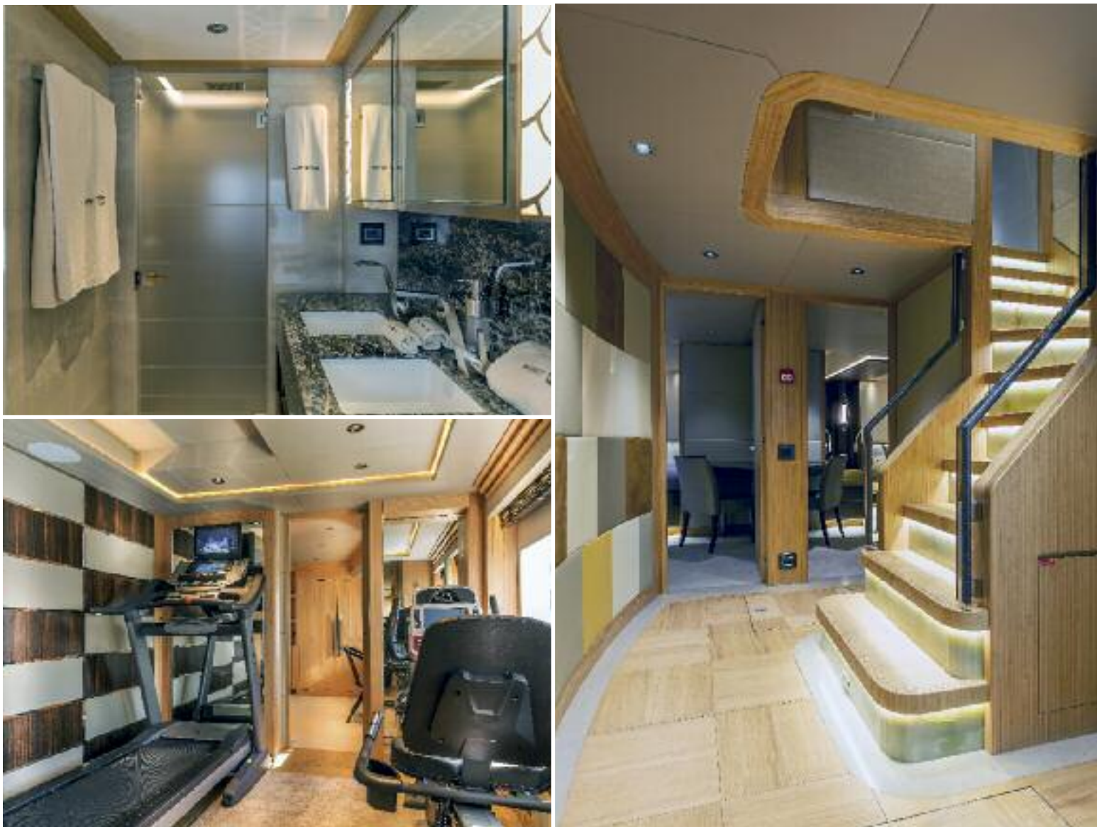
Pullman berths in the twin guest cabins add to the yacht's flexibility in terms of accommodating up to twelve guests.

owner's sun deck area, and sports a full size dining table completely shaded by a fiberglass hardtop. The bar counter area, served by four stools, is fully equipped with a grill, ice maker and fridge.