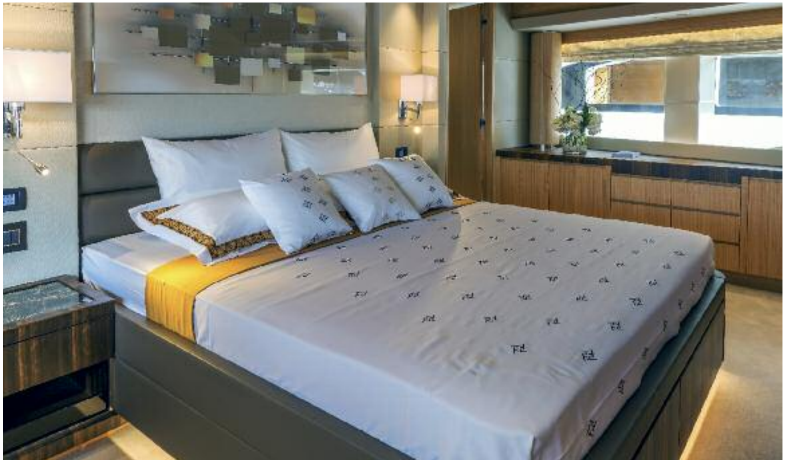
The on-deck VIP with adjacent gym could act as a second owner's suite, making the 110 a great prospect for charter.

touch display monitors at the main helm with two 15" repeaters on the fly-bridge station. Additional aids to navigation and communication include Garmin autopilots, radars, VHF radios, night vision camera and several cameras monitoring system on the superyacht. The aft end of the pilot house has a bench seat for guests wishing to observe the operation of the vessel as it cruises to its destination. Personally however, we'd head to the fly-bridge, which is accessed by floating stairs from the