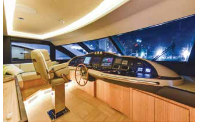
SIT BACK & RELAX Directly left: The yacht's wheelhouse is situated on the upper deck. Below: The bow is a social area aboard with seating, a