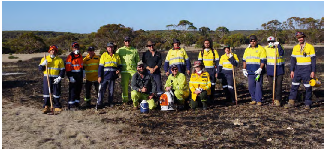
■ Noongar rangers and Bush Heritage staff completed fire training supported by Bush Heritage Australia.

This project and other topics of interest will be discussed at the upcoming events