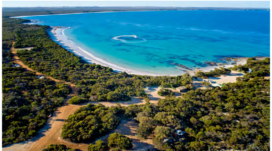
■ Starvation Bay Campground.

After the information has been verified, applicants will