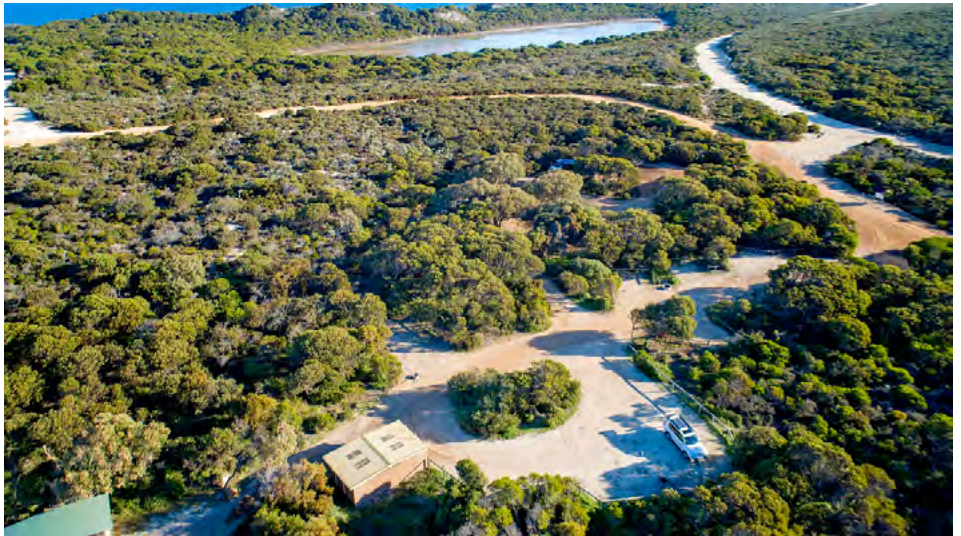
■ Starvation Bay Campground.

To stay up to date on the latest news about campground bookings visit the Book Campgrounds page on www.fitzgeraldcoast.com.au or follow @FitzgeraldBiosphereCoast social media