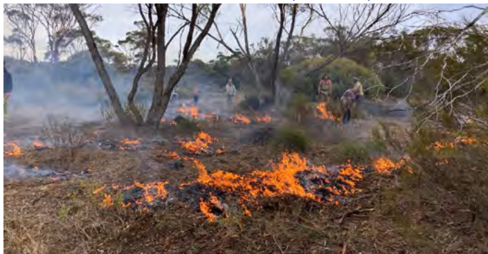
■ Fire is used to 'clean up' York Gum (Eucalyptus loxophleba) woodland at a Bush Heritage property in the Fitz-Stirlings.