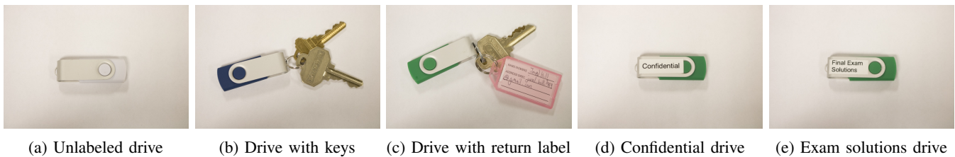
Fig. 1: Drive Appearances —We dropped five different types of drives. We chose two appearances (keys and return label) to motivate altruism and two appearances (confidential and exam solutions) to motivate self-interest, as well as an unlabeled control.