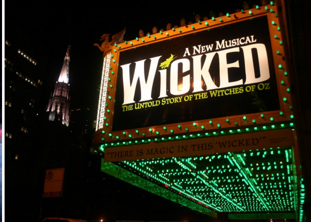
Wicked in Columbus, Ohio (May)