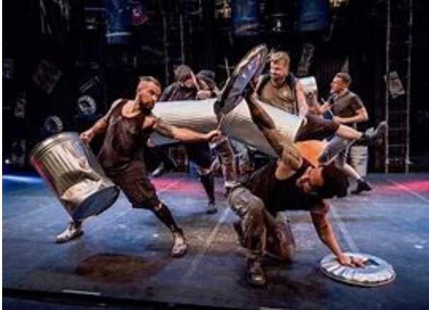
Stomp at Ohio University (April)