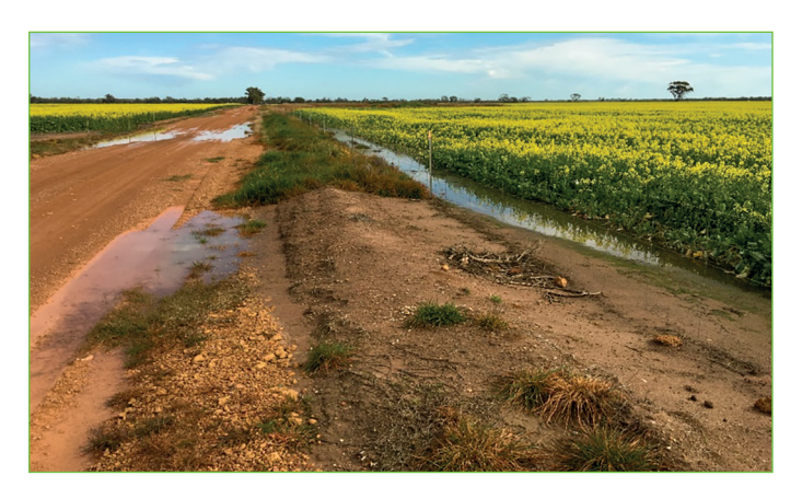
Figure 2: Robust control of annual ryegrass, 12 months after application of Uragan applied at 3 kg/ha with a knockdown herbicide (Moora, Western Australia, 2016).

Fencelines and roadside areas can harbour populations of alyphosate resistant weeds, such as flax-leaf fleabane, sowthistle, windmill grass and feathertop Rhodes grass. Wind-dispersed seed can infest cropping paddocks and pose a biosecurity risk to other areas. A series of experiments along fencelines and roadside areas in NSW confirmed that a single application of bromacil (Uragan) at 3 kg/ha provided robust residual control of grass and broadleaf weeds for up to seven months.<sup>2</sup> As such, Uragan offers an alternative to repeated applications of glyphosate and an alternative mode of action for managing resistant weeds. Adama recommends tank-mixing Uragan with a knockdown herbicide when controlling flax-leaf fleabane, sowthistle, windmill grass and feathertop Rhodes grass.