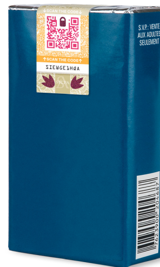
Example of SICPATRACE® tax stamp

These tightly integrated capabilities create a set of reconciliation points between disparate activities to enable immediate identification of non-compliant activities. SICPATRACE® also captures and communicates the product-specific sales information State Attorneys General need to ensure diligent enforcement of MSA terms.