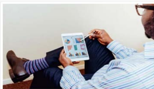
Quick Tips & Tricks Videos

VBCC has added a new section to our website – Tips & Tricks Videos! We are continually adding new content. Click the image below to see for yourself!