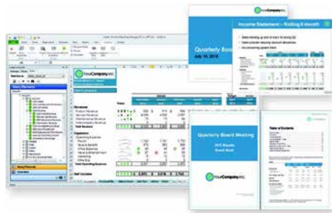
Dynamic Excel Reports Intelligently Linked to Adaptive