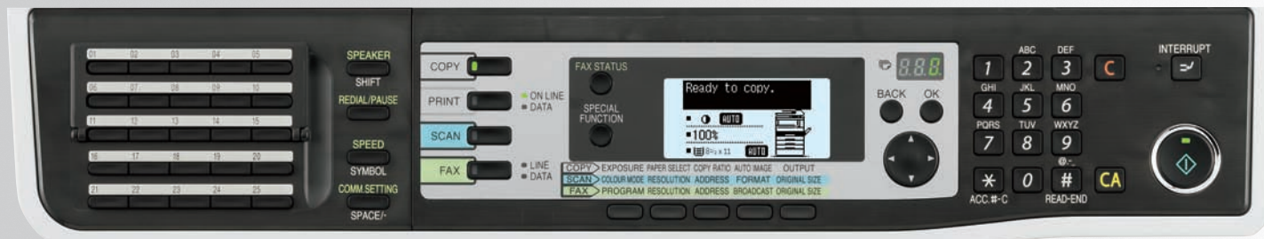
MX-M232D Control Panel.

Maximize capabilities of your MX-M232D with optional full-color network scanning and feature rich network printing! With simple plug-and-play operation, the optional full-featured Network Expansion Kit offers PCL6 and PS3 network printing, walk-up scanning, web-based device management and more. With Sharp's easy-to-use utilities and driver software, the versatile MX-M232D can easily integrate into an existing network environment.