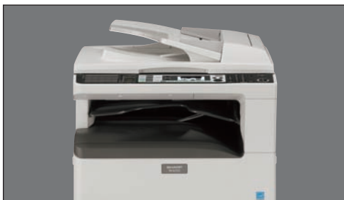
MX-M232D shown with standard 40-sheet Reversing Single Pass Feeder.