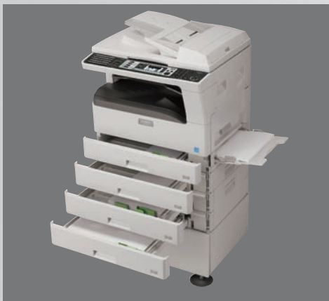
MX-M232D shown with optional 2 x 250-sheet paper feed unit and deluxe low cabinet.