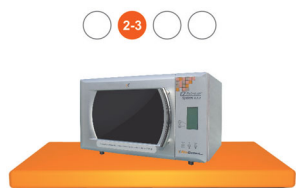
EZ-Retriever ® System Pre-treatment and Antigen Retrieval System