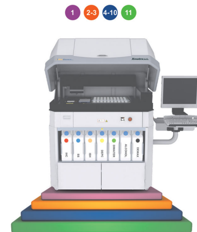
Xmatrix ® Elegance on the Glass Slide... ...from Microtome to Microscope