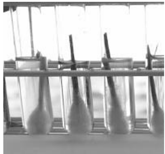
Swabs taken from nostrils