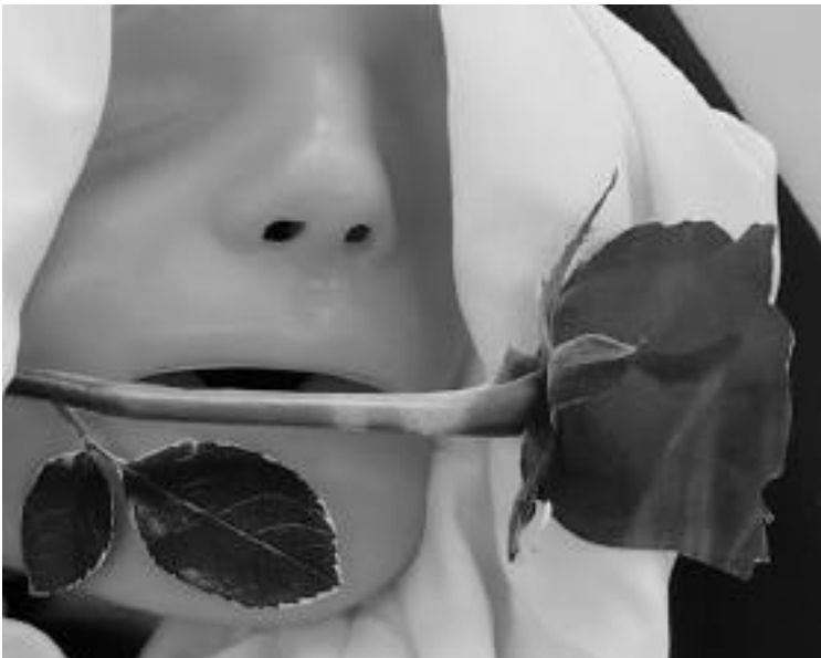
Mannequin with Rose