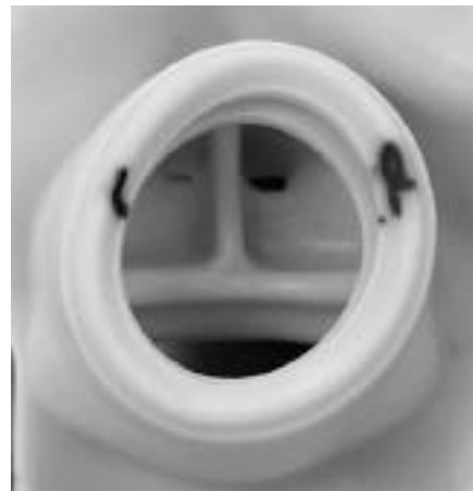
Mannequin Nostrils (interior)