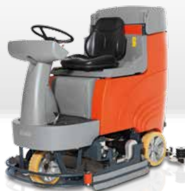
Scrubmaster B115 R cylindrical brush (WB)