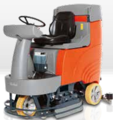
Scrubmaster B115 R plate brush (TB)