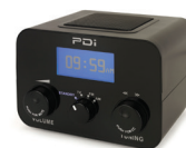
PDI-QUBE Table Radio MODEL NO. PDI-TR100