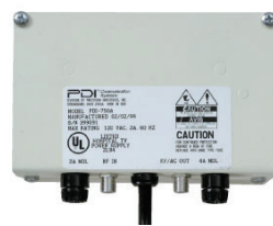
Individual External Power Supply PDI-750AS-C