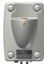
Slim Power Mount PDI-871-G

Ask about 10-tap central power supplies by PDI