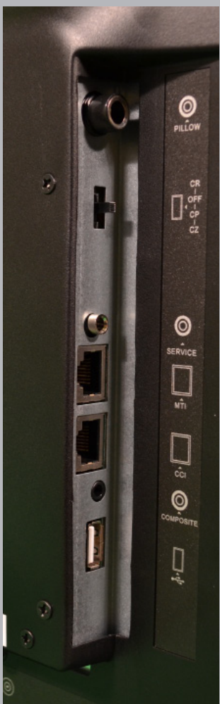
Side Input Panel

This ENERGY STAR® qualified healthcare television by PDi offers your facility the added benefit of operational cost savings from reduced power consumption, without compromising quality or patient comfort. You can make a difference with this environmentally conscious choice to help preserve our environment for generations to follow. ENERGY STAR is a registered mark owned by the US government. This product also meets the regulatory compliance requirements of the California Energy Commission.