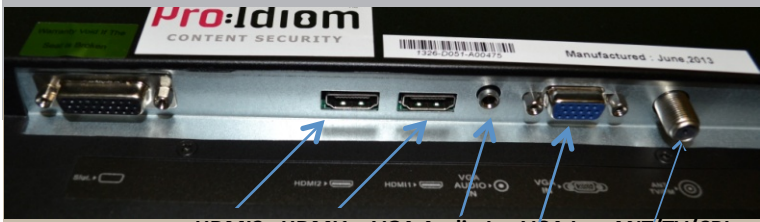
Bottom Connector Panel