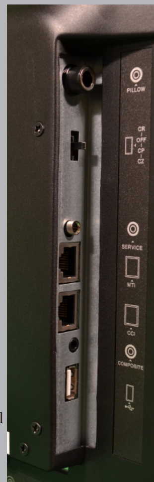
Side Input Panel

This product also meets the regulatory compliance requirements of the California Energy Commission.