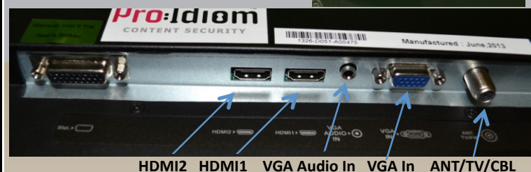
Bottom Connector Panel