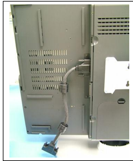
side &amp; bottom mount

Step 9: Attach the DVD cable to the DVD player. Ensure a tight connection by tightening the thumb screws on the cable to the DVD player jack.