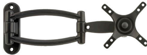
Articulating Wall Mount