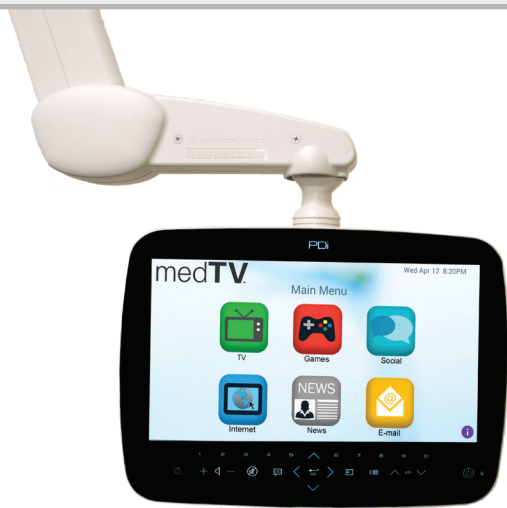
medTAB 14 14" PATIENT TV-TABLET

medTAB™ delivers a touchscreen experience patients understand and enjoy as soon as they touch it.