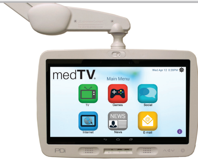
medTAB 19 19" PATIENT TV-TABLET