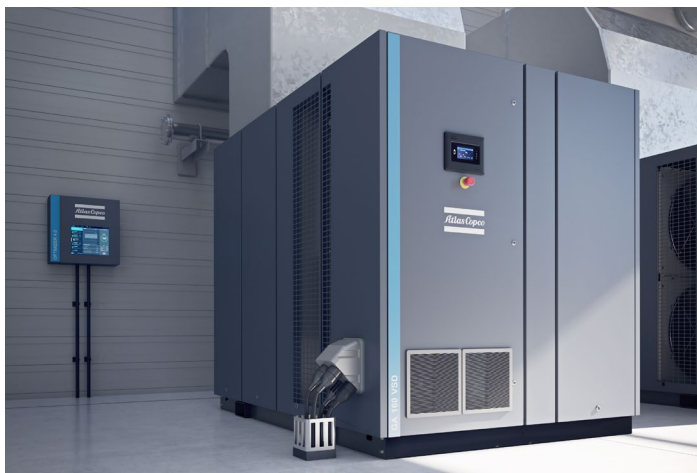
Oil-Injected GA110-160 VSD + and Oil-Free ZR90-160 VSD + models available.

Based on their first full year in the field, customer feedback and outstanding results, we have doubled the initial launch savings challenge. We now guarantee a minimum of $20,000 in savings (subject to model).