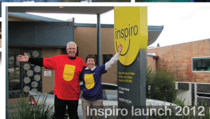
Inspiro launch 2012