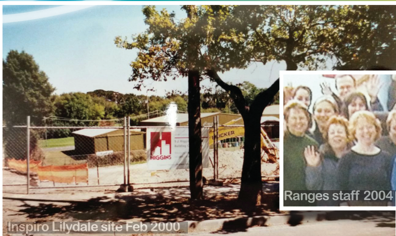
Inspiro Lilydale site Feb 2000