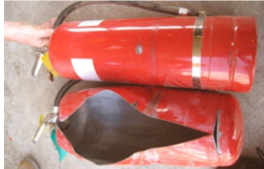
Figure 2 - Burst fire extinguisher due to dent and fatigue cracking (top extinguisher shows identical damage but has yet to reach failure point). These extinguishers are steel and were wall mounted on a ship (not a Lifeline cylinder)