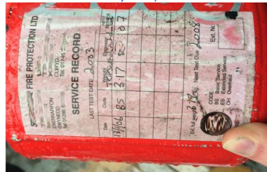
Figure 4 - Non-approved service label