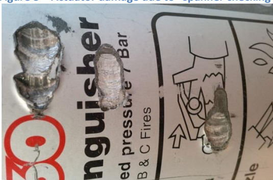
Figure 5 - Deep gouges in cylinder