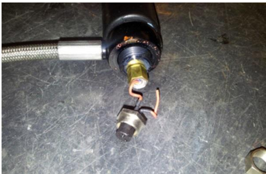
Figure 3 – Actuator damage due to “spanner checking”