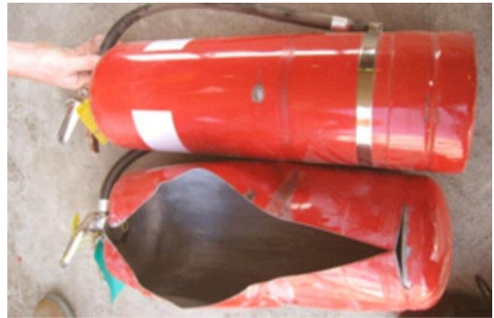
Figure 2 - Burst fire extinguisher due to dent and fatigue cracking (top extinguisher shows identical damage but has yet to reach failure point). These extinguishers are steel and were wall mounted on a ship (not a Lifeline cylinder)