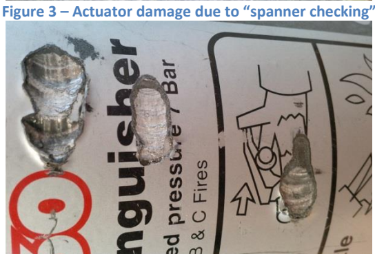
Figure 5 - Deep gouges in cylinder