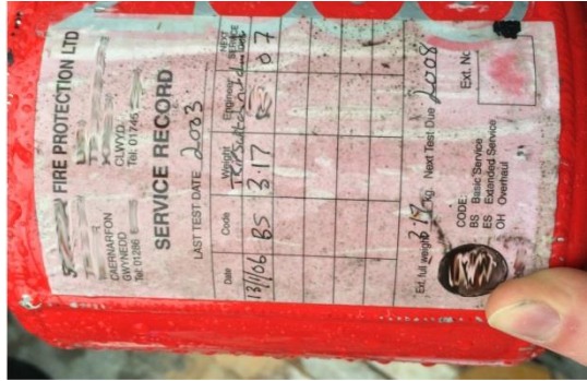
Figure 4 - Non-approved service label