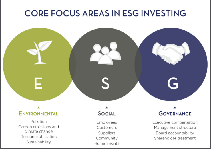
Exhibit 2: Core Focus Areas in ESG Investing

In the evolving world of impact investing, including ESG factors as part of the investment process can be viewed as the next step, leading to a more holistic approach to investing. Often times, when seeking to implement an impact investment program, investors typically use negative screens to reduce the investment universe by eliminating specific exposures not in line with the organization's mission or values. For example, investors with a religious affiliation may exclude certain industries and their underlying securities. These investors may apply a negative screening approach to exclude companies in the alcohol, firearms, defense, tobacco and gambling industries.