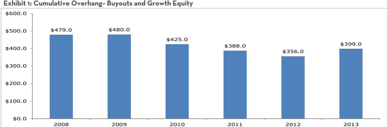
Exhibit 1: Cumulative Overhang-Buyouts and Growth Equity

Approximately $399 billion of the estimated $1 trillion of investable private equity capital (Exhibit 1) is allocated to buyout and growth equity investments; 80% of these funds were raised after 2011.iv The capital overhang dropped to a five-year low in 2012, before trending higher at the end of 2013. As of January 2014, a record 2,084 private equity funds were in the market seeking to raise an aggregate $750 billion.vi This number does not take into account the amount of institutional capital or contributions from Limited Partners ("LPs") available for co-investment alongside General Partners ("GPs").