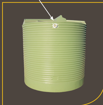
6:00 (Six O'Clock) Side

Some overflows are fitted into the ribs of tank roof which are not exactly opposite