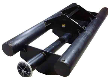
With Pump Shroud (Optional Extra)