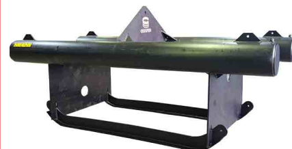
With Skid Legs (Optional Extra)