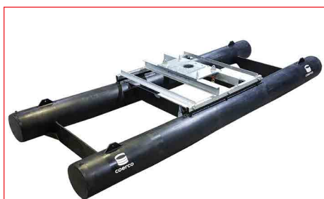
Custom Build to Suit Vertical Bore Pump