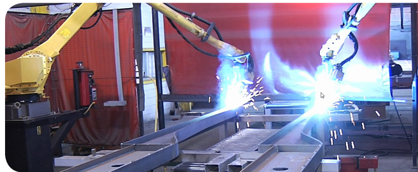
SalSon manufactures its own chassis – the most advanced on the road.