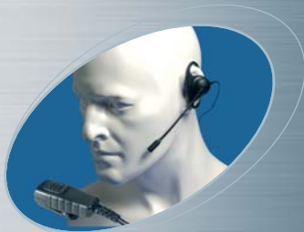
■ EA19/750 ● EA19/850 ▲ EA19/950