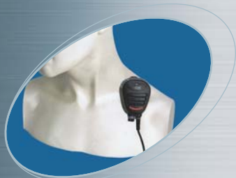
■ CMP750 ● CMP850 ▲ CMP950