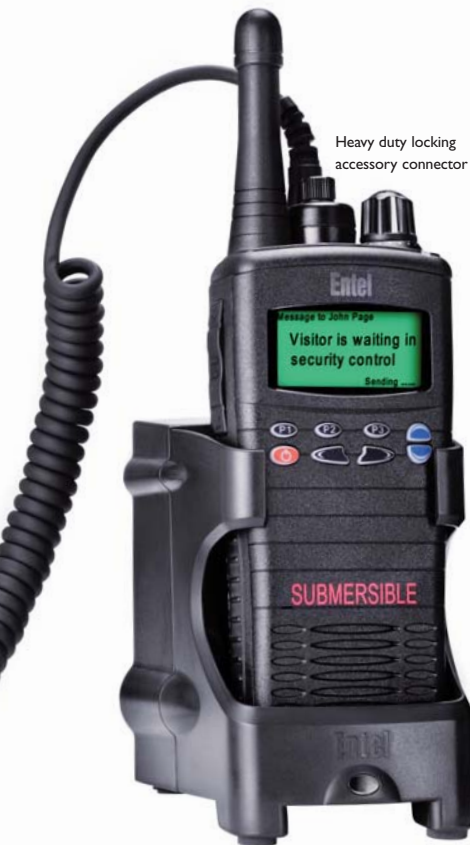
Pictured: Radio with optional stubby antenna and CSAHT rapid charger

HT Series 2.0 – a model for every application. From entry level to sophisticated MPT1327 trunked variants, the HT Series 2.0 is built without compromise to deliver loud and crisp audio using the latest compander noise reduction technology.