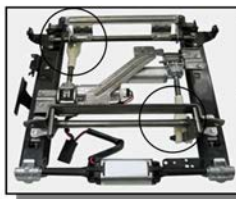
Seat Actuator Gearbox Thrust Bearings