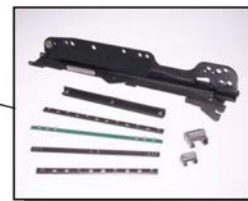
Upper & Lower Seat Track Bearings