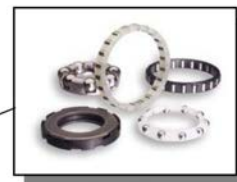
Seat Adjuster Bearings