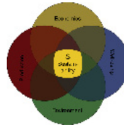
The four components of agricultural...