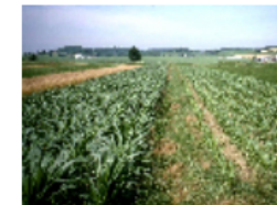
Plots in the Rodale Institute's Farming...