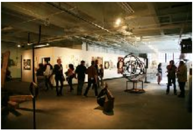
Dolphin Gallery (during Industrialism exhibition)