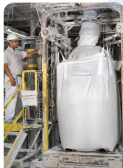
Bulk bags can be filled directly on FirmaLoad pallets.

The bottom line? FirmaLoad bulk bag pallets are tailor-made for your bulk bag transportation needs.