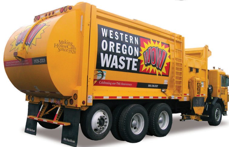
^ Newsletter, mascot and fleet graphics