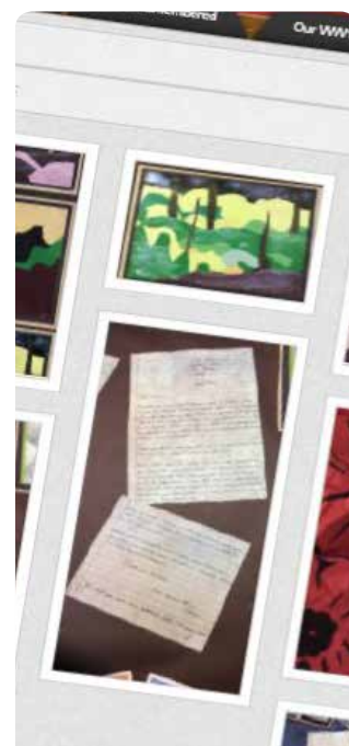
Evidence capture with FrogSnap

The Frog Learn platform was great in helping facilitate communications between the students in France with ourselves; we issued the French students with logins so they could easily create and share resources on the site and collaborate with our students at North Lakes. They also had a private section of the site in which they could discuss what they were learning about the war in England internally. The whole project was a great experience for all the students, and Frog Learn was able to give the project