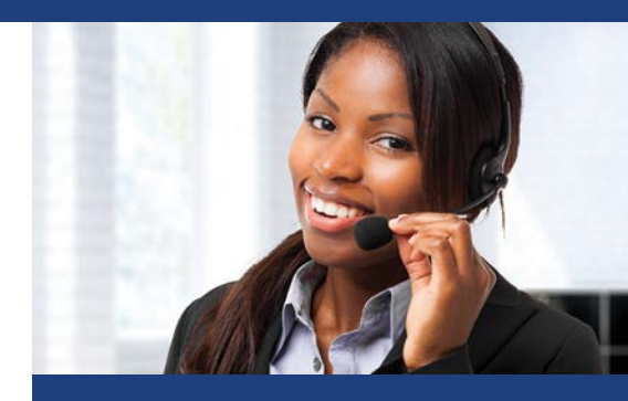
We're just a phone call– or a click–away!

Our Goal – is to create a positive difference in your life.