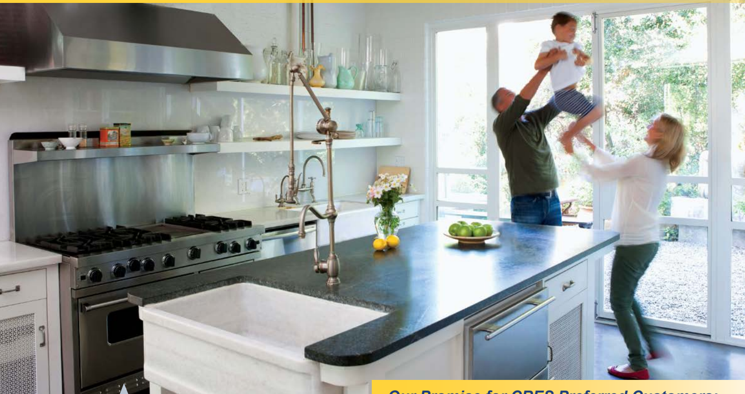
Our Promise for CRES Preferred Customers: Never pay a Trade Call Fee unless we render service!

45 YEARS People Helping People<sup>ss</sup>