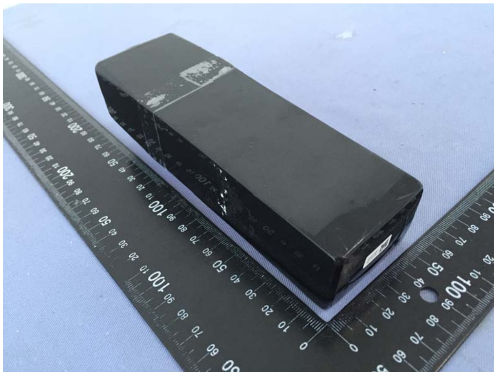
Figure 2 Overall view of battery (外观图)