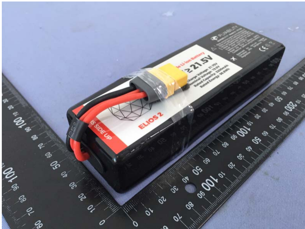
Figure 1 Overall view of battery (外观图)