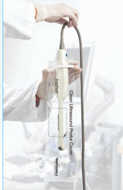
Clean Ultrasound Probe Covers protect the entire probe, including the handle, from recontamination after high level disinfection.

Clean Ultrasound Probe Covers provide a simple way to deliver best practice patient care while meeting the requirements of reprocessing guidelines and recommendations.