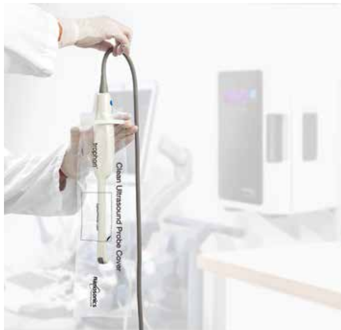
Clean Ultrasound Probe Covers protect the entire probe, including the handle, from recontamination after HLD.

Clean Ultrasound Probe Covers provide a simple way to deliver best practice patient care while meeting the requirements of reprocessing guidelines and recommendations.