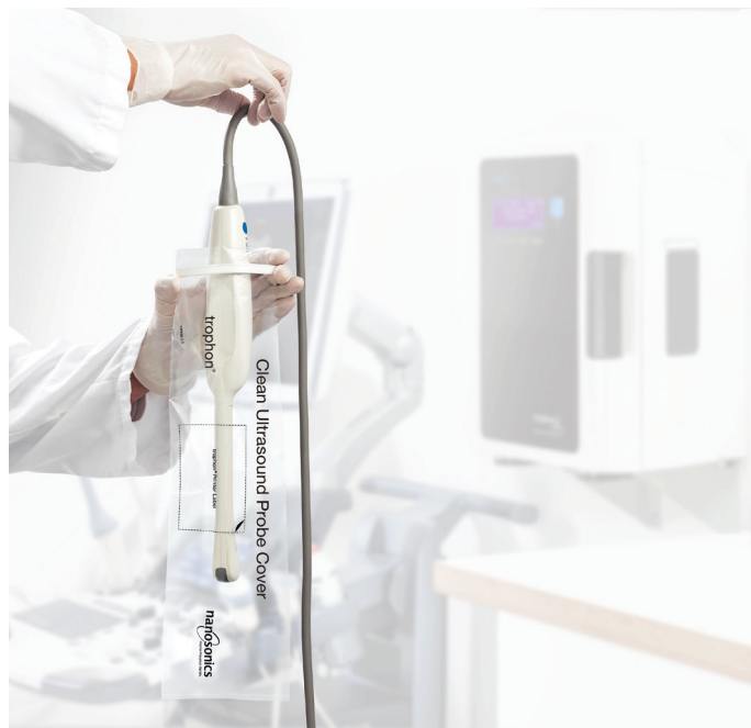
Clean Ultrasound Probe Covers protect the entire probe, including the handle, from recontamination after HLD.

Clean Ultrasound Probe Covers provide a simple way to deliver best practice patient care while meeting the requirements of reprocessing guidelines and recommendations.