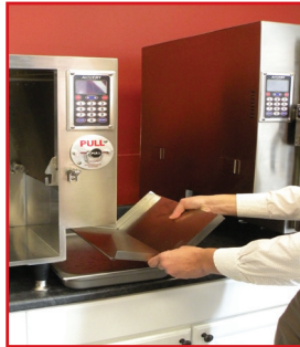
B. Food Exit Chute