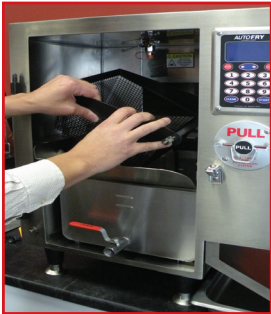
A. Teflon Coated Wire Cook Basket