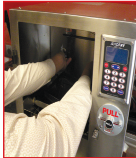
C. Filter Cover Plate