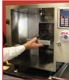
D. Grease Baffle