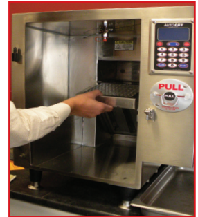
E. Second Filter