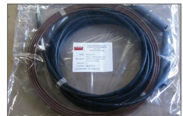
Door Surround Heater