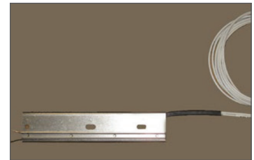
Door Guide Heater