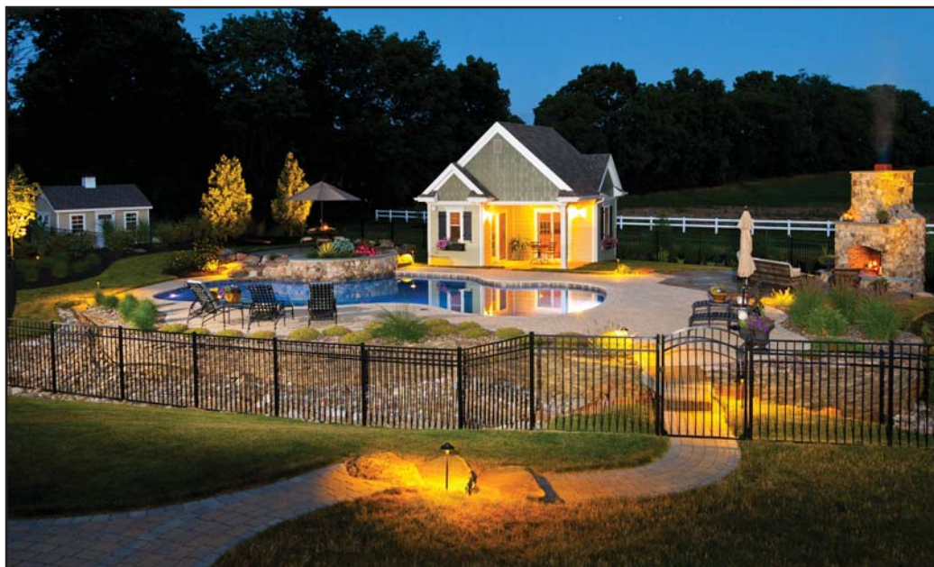
Creative lighting is the key to adding drama and nighttime usage to your outdoor space