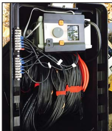
Our demo kit brings the magic of lighting to your location.

We can then put a plan and budget together so you know not only what you'll be getting, but how it will look. Give us a call to schedule your lighting demo today!